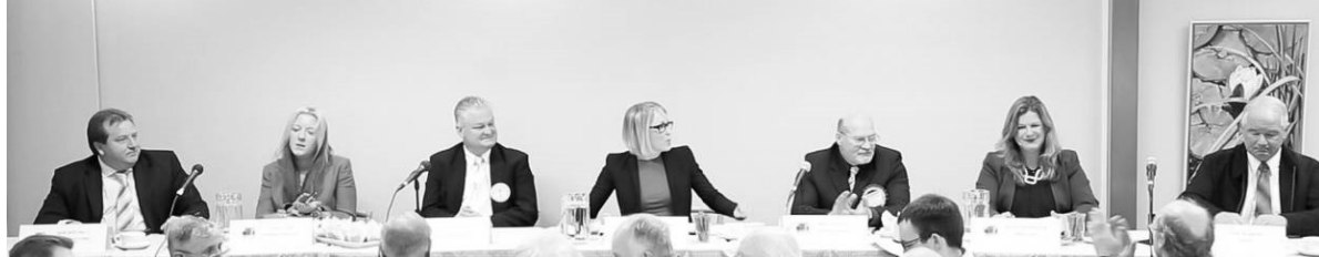
The full panel